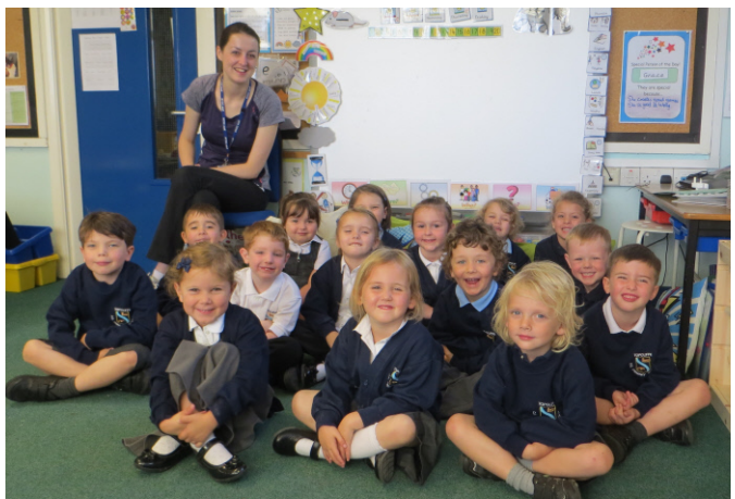
Lots of smiling happy faces looking forward to life as school children in Topcliffe.