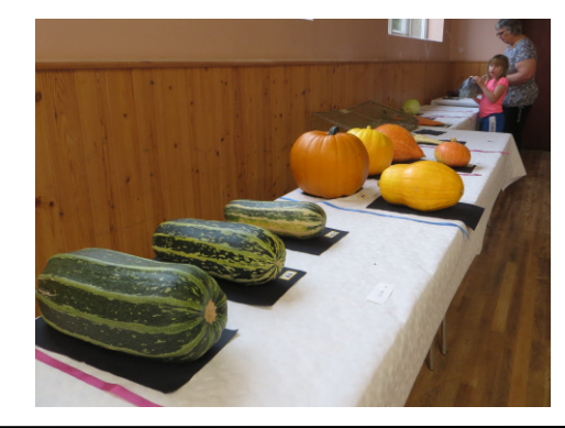
A Date For Your Diary

By popular request, CALL MY WINE BLUFF is returning to Topcliffe and Asenby village hall.