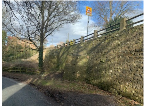
Mill Bank - where repairs are scheduled

The works should be underway this week and be completed by 24 April. The highways department warn of possible disruption throughout the contract period, though the road will remain open to traffic with two-way lights at certain times. Access to private properties will be maintained, though there may be temporary restrictions from time to time.