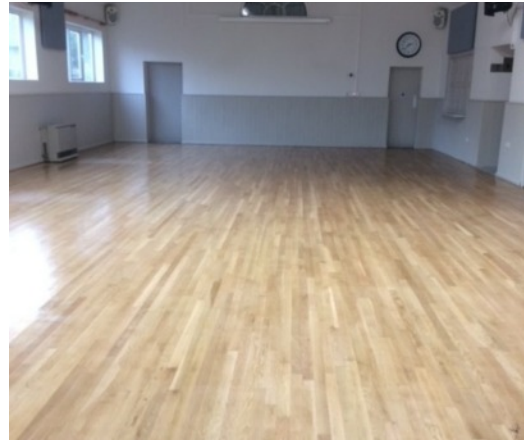
Village Hall floor resurfaced Jan 2021

In the last few weeks painters have been in the hall to completely redecorate the main hall, kitchen, entrance lobby and toilets. The acoustic panels have been temporarily removed to facilitate the work. Although the hall remains closed because of Covid, it is clean, fresh and ready for a return to use at the earliest possible time.