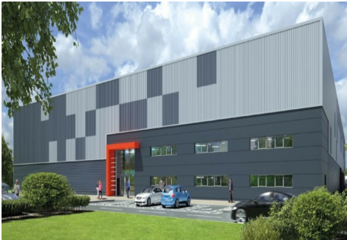
What the development at Dalton 49 could look like

The site, 'Dalton 49 Thirsk', named after the A168 junction number, will be a 43-acre development which will provide a range of job opportunities and a boost to the local economy.