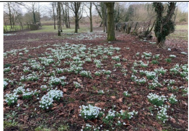
Two views of the Sheepwash just a month apart! The one on the left, with a beautiful reflection, was taken during the floods in January. The other is of the snowdrops in February.