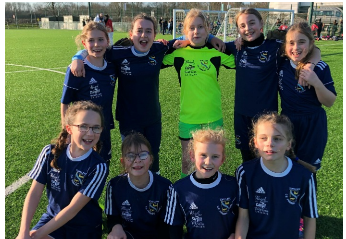
Y5 6 Football County Finals.

Nine pupils from Topcliffe Church of England Academy recently travelled to York College to participate in the North Yorkshire Girls Under 11s County Football Finals. The team had successfully won the two prior stages which were for the Thirsk area and then the Hambleton area in order to compete at county level.