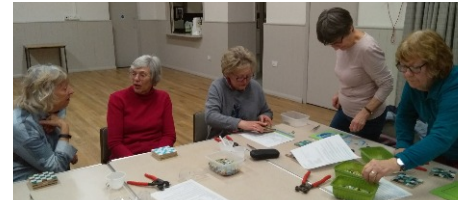
Mosaic making with Rural Arts.

This regular class is now attracting new participants who are getting hands-on experience of a wide variety of arts and crafts...and enjoying some good company.