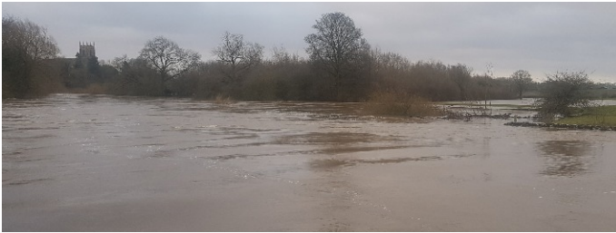
High water near The Mill

Fortunately, Catton Lane has only flooded once recently and that was near the Sheep Wash. When it does flood it is advisable not to drive through it unless you're driving a tractor!