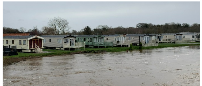
River Swale nears danger level

Amanda said: "As everyone knows, the holiday park is particularly vulnerable to flooding during periods of heavy rain and we've seen an unusual amount of rain this year so far. During the last weeks of February the park was on special alert as the River Swale was regularly lapping against the top of the river bank. We had to call for assistance from Hambleton Council when the water was in danger of flooding on to the park and breaching our defences and were pleased when a pallet full of sandbags arrived to plug the gaps. Nonetheless, things were so bad that the site had to be evacuated... meaning the few still staying at the park had to seek accommodation elsewhere until the danger passed."