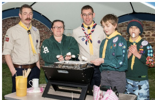
Members of the 1st Topcliffe Scout troop toasted marshmallows for guests at the event.

"It has been explained to me that Topcliffe & Asenby Village Hall is different - possibly unique - in that it is shared between two communities on opposite sides of the River Swale, in different parishes, different boroughs (Hambleton and Harrogate), different county divisions and even different parliamentary constituencies.