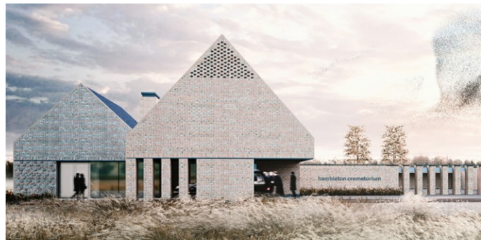
Artist's impression of the proposed crematorium